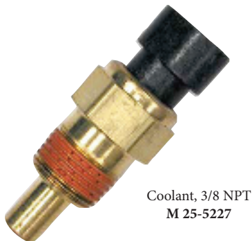
Coolant, 3/8 NPT M 25-5227