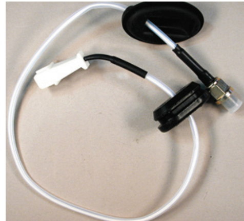
Cylinder-head, M10x1.00 RH M 0280 070