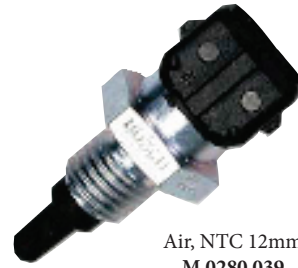
Air, NTC 12mm M 0280 039