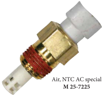
Air, NTC AC special M 25-7225