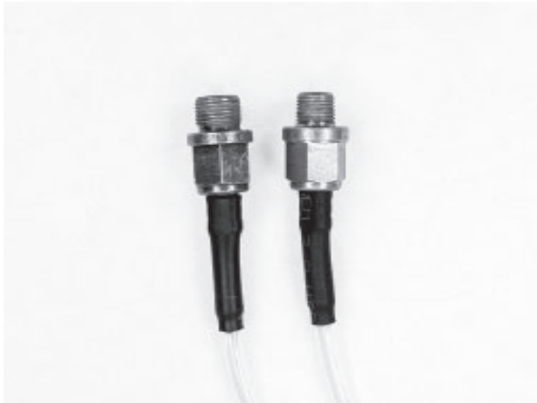
Cylinder-head, M12x1.00 LH M 0280 059