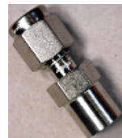
1/8" K-Type Thermocouple stainless bung M TC SS20012WBT