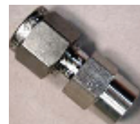
1/4" K-Type Thermocouple stainless bung M TC SS40064WBT