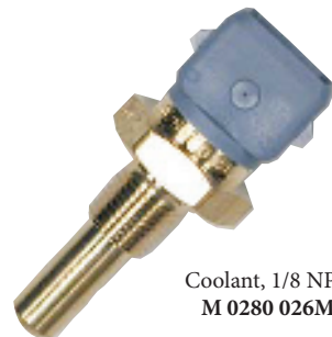
Coolant, 1/8 NPT M 0280 026M