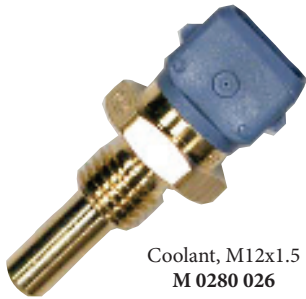
Coolant, M12x1.5 M 0280 026