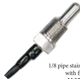
1/8 pipe stainless temp sensor with flying lead M 25-2197 D