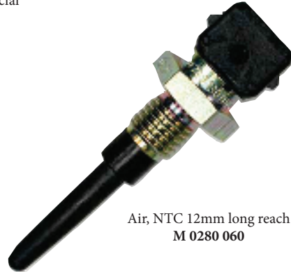
Air, NTC 12mm long reach M 0280 060